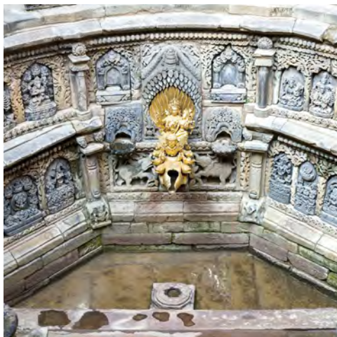
Ritual bathing pool, Hanuman Dhoka, Kathmandu

This morning, take a heritage walking tour exploring the Old Town with its bustling bazaar, dominated by the imposing 17th-century Leh Palace and its museum. Continue to one of Ladakh's most breathtaking monasteries: Shey Palace and Monastery, with its colossal gilded statue of a seated Shakyamuni Buddha, considered to be the second-largest Buddha statue in Ladakh. Also visit Thiksey Gumpa, a Buddhist monastery with beautiful prayer rooms and temples. After a picnic lunch, drive east to a secluded valley and the Hemis Monastery, one of Ladakh's wealthiest monasteries. Return to the hotel, or opt for a drive to the village of Choglamsar for a séance session with the village Oracle. B, L, D