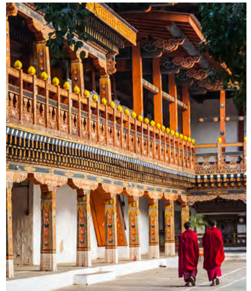
Monks at Punakha Dzong, Bhutan