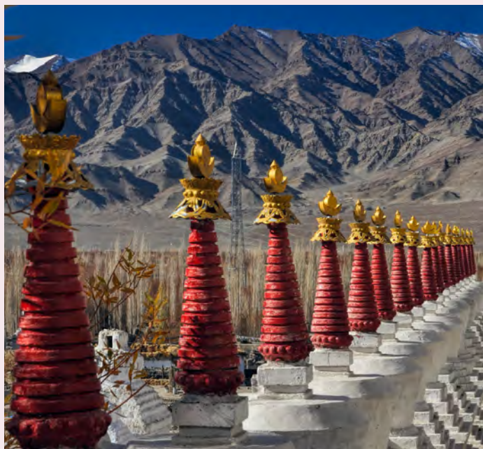
Photos from top: Temple carving, Patan Durbar Square, Kathmandu; Colorful thangka at the Hemis Monastery in Leh, Ladakh; Thiksey Monastery, Leh, Ladakh