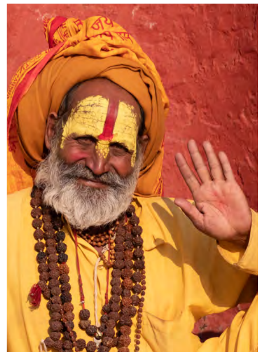
Photos clockwise from top right: Changu Narayan Temple, Kathmandu, Nepal; Indus River; Pilgrim in Kathmandu, Nepal; Shanti Stupa, Leh, Ladakh; Hemis Monastery, Leh, Ladakh; Regional map. Front cover: Swayambhunath, Kathmandu, Nepal. Back cover: Maitreya Buddha statue at Likir Monastery, Leh, Ladakh (top); Taksang (Tiger's Nest) (bottom).