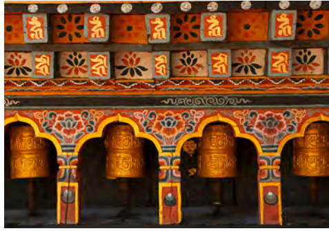
Prayer wheels, Thimphu

At nearby Ramthangka, gather for an optional half-day hike to the legendary Taktsang (Tiger's Nest), a breathtaking Buddhist monastery perched on a cliff 10,000 feet above the Paro Valley and one of the most sacred Buddhist sites. A less strenuous option will offer views of Tiger's Nest and a visit to view the ruins of Drukgyel Dzong, which was destroyed by a fire in 1951 but remains an impressive sight. B, L, D