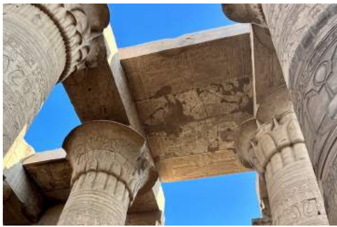
Abu Simbel, Small Temple