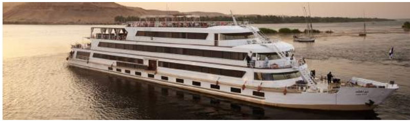
Sanctuary Nile Adventurer

The elegant Sanctuary Nile Adventurer has just 32 cabins. Decorated in a contemporary style, the ship's design combines modern Egyptian culture with 7,000 years of heritage.