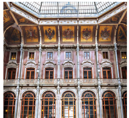
Palácio da Bolsa, Porto, Portugal