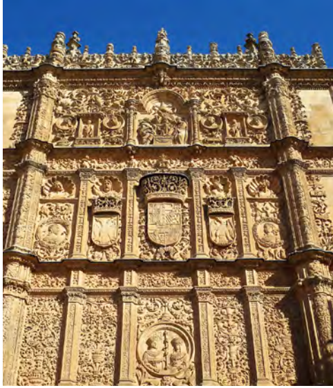
Universidad de Salamanca, Spain

An optional prelude in Porto is offered from October 11 – 14, 2023.