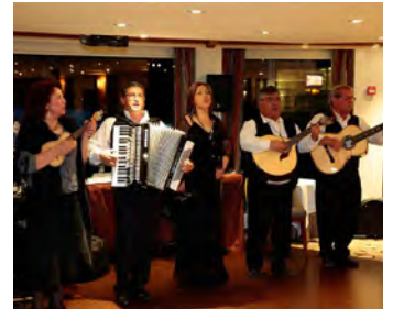
AmaDouro's Main Restaurant (left) and Portugal's traditional fado singers

Launched in April 2019, this luxury river vessel features 51 spacious, elegantly appointed staterooms and suites. Staterooms include Entertainment-On-Demand, featuring free high-speed Internet access, unlimited Wi-Fi, movies, music, and English-language TV stations; climate-controlled air conditioning; and an in-room safe. The ship's Panoramic Lounge is a stylish and inviting space to enjoy a glass of wine or a cocktail along with nightly entertainment. AmaDouro also features a massage room, fitness room, sun-deck swimming pool, and a gift shop, as well as the culinary delights of the Main Restaurant, where guests are able to sample the region's famous Port wine.